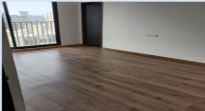
SPECIOUS MASTER BED ROOM WITH WOODEN FLOORING & ATTACH TOILET